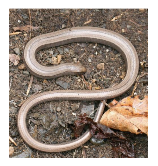
Slow Worm

in the group were as busy as ever but were particularly pleased to find Blue-leaved Petrocoptis