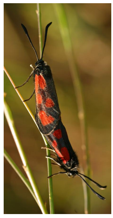
Slender-scotch Burnets

Owlfly called Libelloides coccajus a relative of the Ant Lions, Val had previously photographed one on the day she was sick. We also found a mating pair of Slender Scotch Burnet, startlingly coloured day flying moths, as well as Spotted Fritillary butterfly.