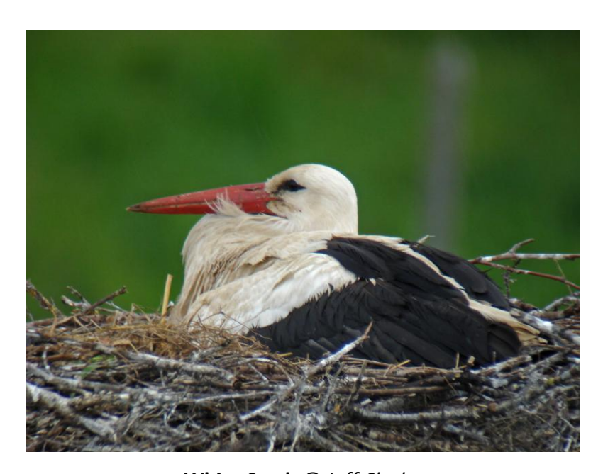
White Stork

From here we took a route that looped around the Embalse de Augilar de Campoo. We stopped at a fabulous orchid rich meadow which had everyone captivated. New species here included Dull and Yellow Ophrys, Early Spider and Barton's