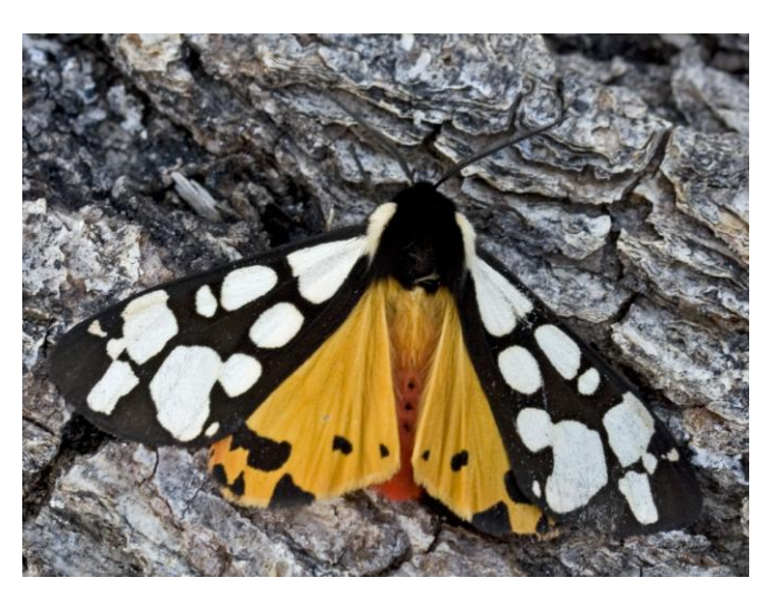
Cream-spot Tiger

After our evening meal we set the moth trap and then ventured out in search of mammals, but other than the Common Pipistelles, the two mammals crossing the road remained unidentified so we contented ourselves with a spot of star gazing. It's amazing how many stars are visible when the air isn't filled with man-made light pollution.