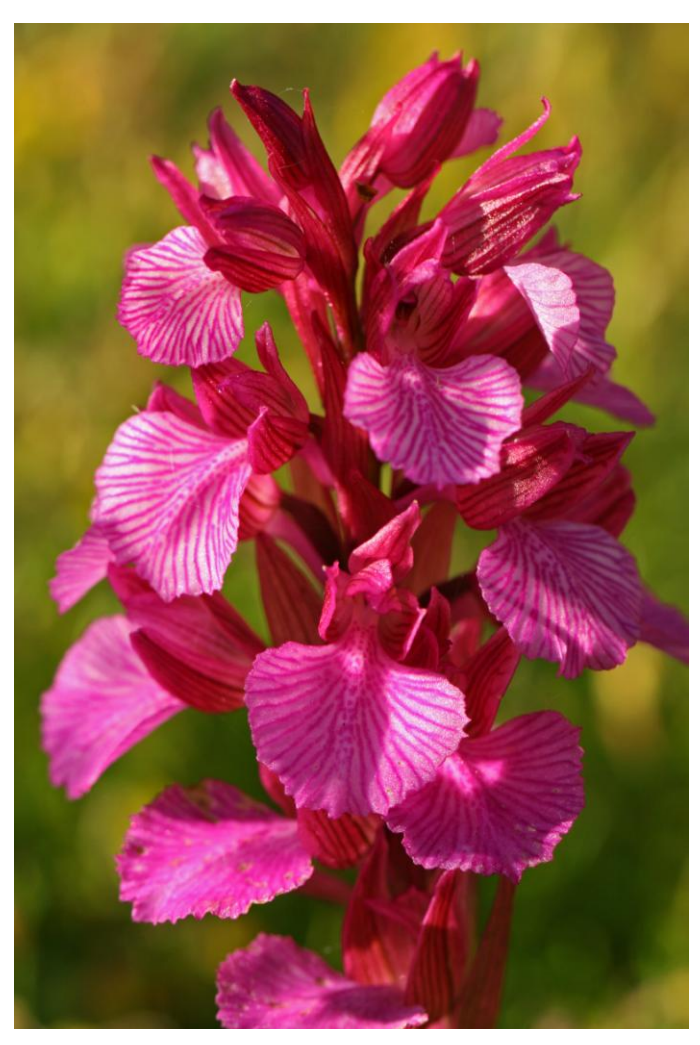
Pink Butterfly Orchid