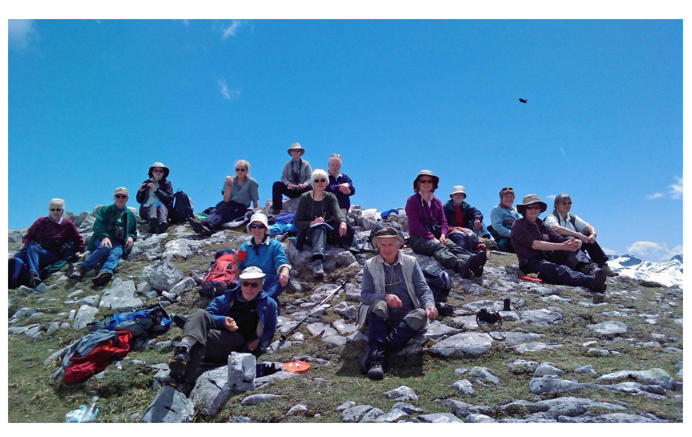
May 2010 Picos De Europa Tour Group