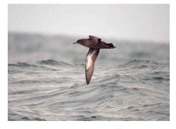
Sooty Shearwater

Dove which took refuge on the ship's bridge. At sea the star bird was undoubtedly a single Sooty Shearwater. A bird out of time and place, it should just be completing its breeding season in the Southern Atlantic. The 53 Manx Shearwaters were more expected though surprisingly most were seen in the northern part of the bay than in the Western Approaches. The most