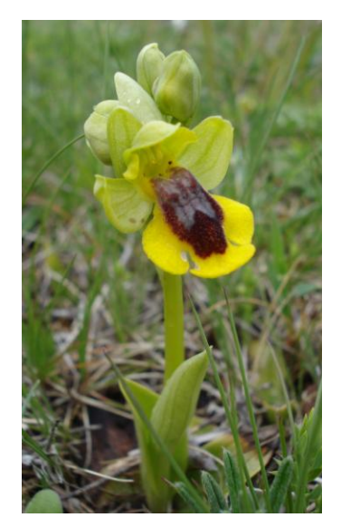
Ophrys lutea

Orchid as well as Pyrenean Fritillary. We then entered an area commonly referred to as Stork City. It lived up to its name with White Storks and their nests dotting the area, many on purpose built poles.