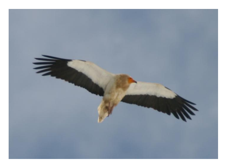
Egyptian Vulture

The up-lighting from the snow created beautiful detail on the overflying Griffon and Egyptian Vultures.