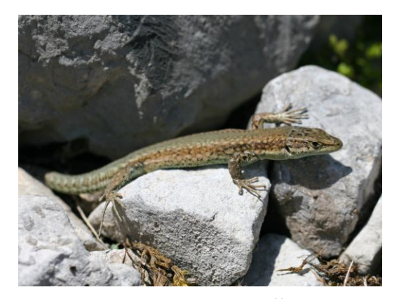
Iberian Wall Lizard

We stopped close to the Dobres tunnels and from here enjoyed stunning views across the Karst limestone landscape. Red-billed and Alpine Chough were much in evidence. A Blue Rock Thrush proclaimed his territory from a nearby limestone outcrop and we had close views of a Griffon Vulture as it sat in its cave nest entrance. Crag Martins were prospecting potential nest sites and Common Kestrels played in the up-draughts on the cliff faces.