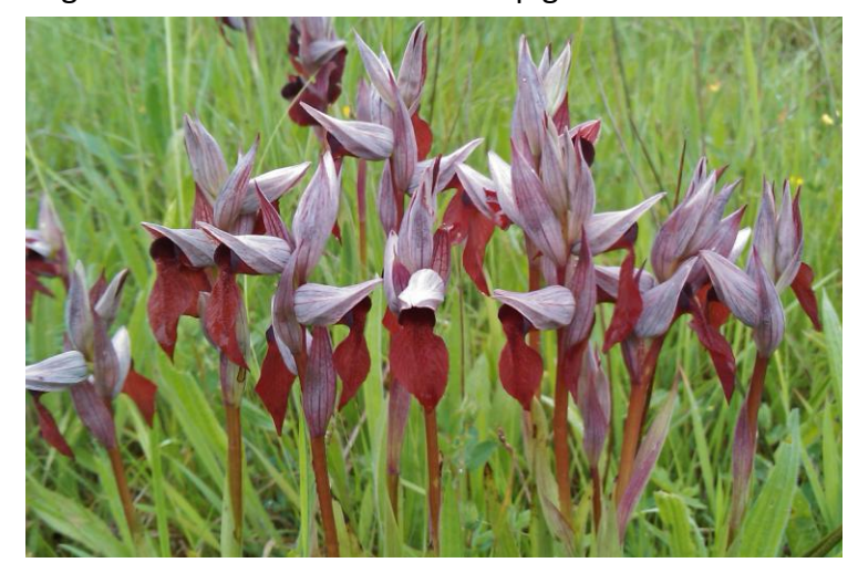
Heart-flowered Tongue Orchids at Santander Airport

After a stop at the excellent Visitor Centre we then headed for Santander Airport ostensibly to allow Jeff to sign up for driving the mini- buses. However a small meadow adjacent to the car park area gave the botanists their first taste of what was to come as Heart-flowered Tongue Orchids decorated the damp ground and Robust Marsh Orchid was also present.