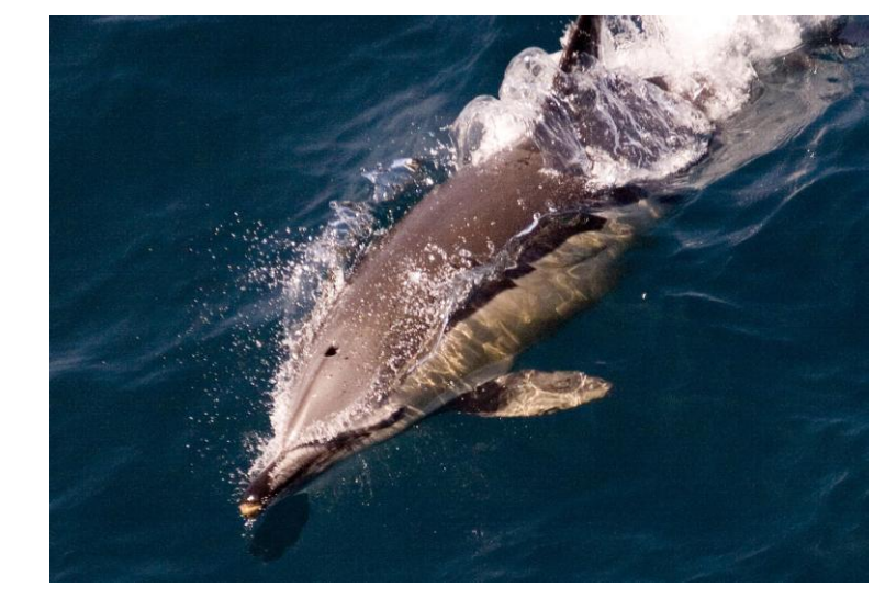
Common Dolphin

The following morning we awoke to thick fog which persisted virtually all the way up the English Channel so we contented ourselves with mapping our tour and reviewing what we had seen and where.