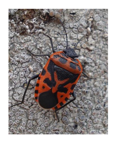
Eurydema ornate

We took lunch in a fishermans retreat close to the village of Salinas de Piseguero. Crossing the river we had seen a large