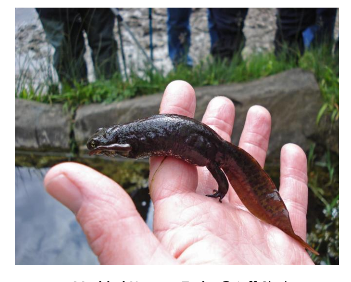
Marbled Newt at Tudes

Lunch was taken in the delightful village of Tudes, with a brief stop enroute to enjoy the spectacular Pink Butterfly Orchid. Here we had close encounters with Middle Spotted Woodpecker and a nesting Common Resdstart. From here we walked to Valmeo. We stopped to explore a water trough and found Marbled and