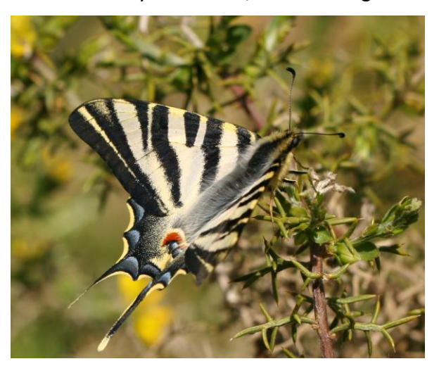
Scarce Swallowtail

We then headed for a primary venue of the day; the meadows above Espinama. This walk really showed the potential of the area both entomologically and botanically. Plants included Hoary Rock Rose, Adders Tongue Fern and a host of orchids including the