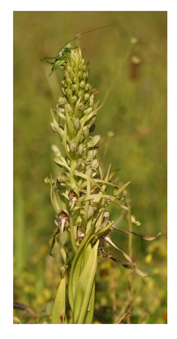
Lizard Orchid

We also found some wonderful invertebrates including an Ascalaphid, or