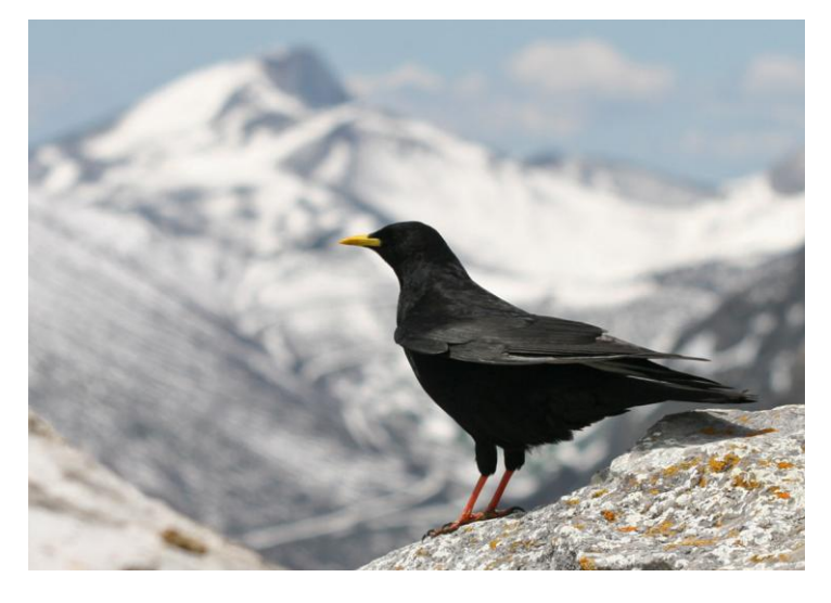
Alpine Chough

Wheatears were prominent among the birds, most of which were difficult to get to grips with, though a Blue Rock Thrush gave itself up to a few people as did a distant pair of Alpine Accentors. The one bird that did not make its self scarce was the Alpine Chough which gathered around us in numbers waiting for a free handout.